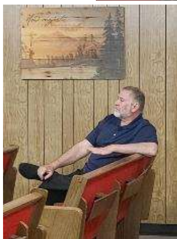
Below Right Filese greeting the people.