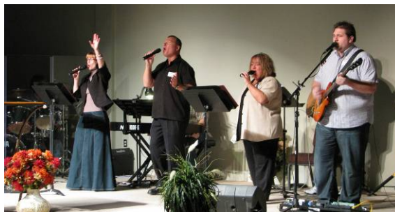
Middle – TCC Worship Team