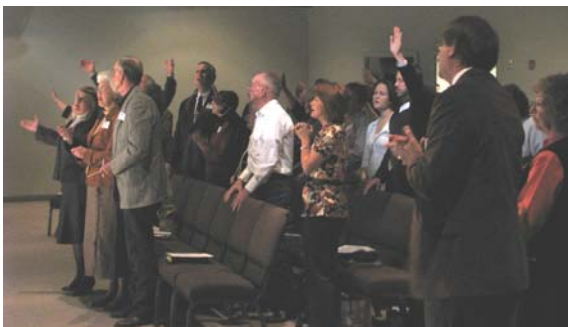
Middle – Full House