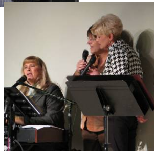
Middle – Chosen F.E.W.