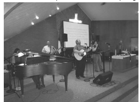
Turpin UMC Praise Team