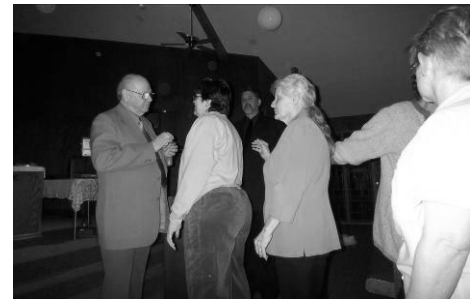
Healing & Wholeness Service at Turpin UMC

them. Also, to share their love and hearts about what God was doing in and for them through the services.