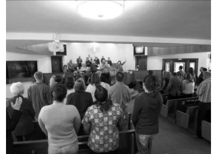
Christian Life Church Service Tonkawa, OK