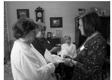
Communion together at Edmond Retreat.