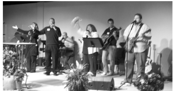
Above: TCC Praise Team at SGMM Word Conference 2007