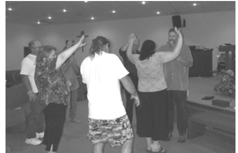
Prayer during Revival in Wilson, OK

"A Whole Lot of Heaven in 2007" Matthew 25:21 SGMM Word & Scripture for 2007