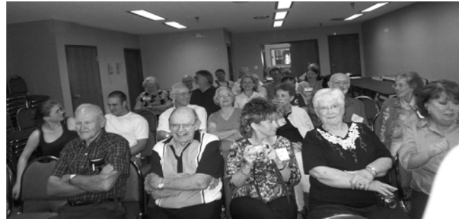
Above: Family at Worship Service