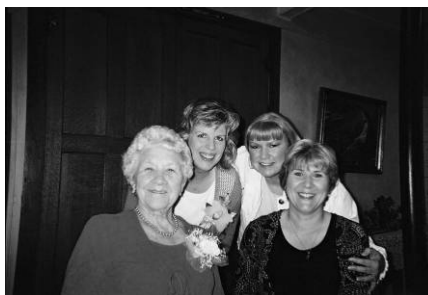
Mother's Day 2007 in Kingfisher, OK for Mother & Daughter Luncheon