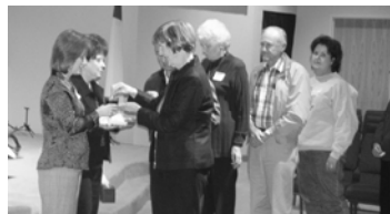
Above: Full House worshipping the Lord together Left: Sharing Communion together