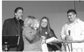
Commemorating 25 yrs of marriage 20 yrs of ministry