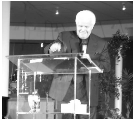
Above: Jesse Duplantis ministering the Word at the Ephesians 4 Conference