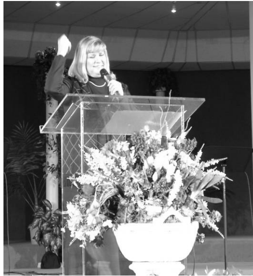
Filese minister's in testimony at Ephesians 4 Conference